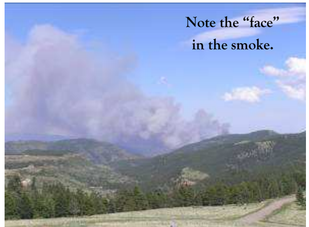
Note the "face" in the smoke.